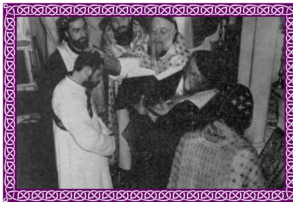
(Source: page 280 issue 75 of May 1970 year 8 of the Patriarchal Journal).