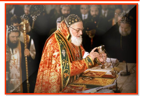
H.H. celebrates a Holy Mass at the Church in Antioch in 2000